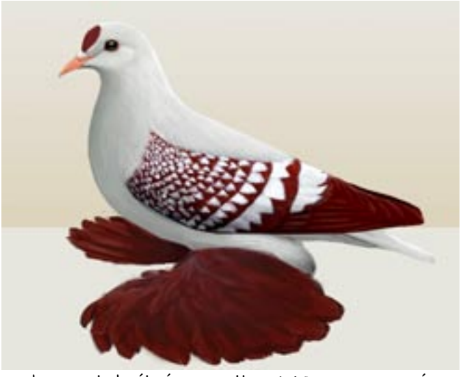
Red Spangled Sílesían Swallow Art By Gary Romig