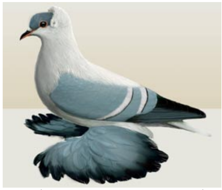
Blue White barred Fullhead Swallow Art By Gary Romig

Our band sales went well this year as we sold all of the muffed bands and were only left with about 100 clean leg bands. I have placed the same order for next year being 2500 muffed bands and 1000 clean leg bands. It looks like next year we will not be able to get the metal bands. There was a problem with the supplier of the metal bands. I know many members were glad to get the metal bands for this year. Membership is down a bit as we have lost a few members.