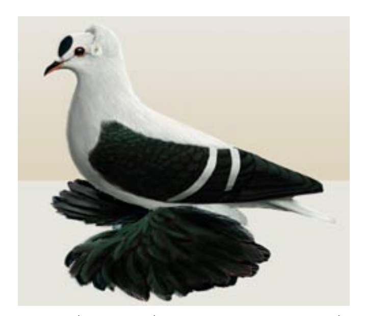
Black White Barred Fairy Swallow Art By Gary Romig