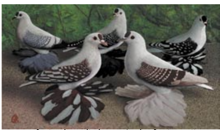
Group of Bohemian, Silesian And Reiserflugle Swallows Art By Gary Romig

Second, the show coop size has become an issue. The coops have been on the large size at Louisville lately and the one drawback is the way the water cups were set up-they were being knocked over easily. Also, it is a little harder to catch and handle the birds in the larger coops. At Des Moines, we had the opposite. The birds were in small, four hole coops. By the end of the show, the birds tails and muffs were all frayed. I felt we didn't give the birds justice in the smaller coops. You couldn't get a good look at the birds. They weren't allowed to show from their cages. When we are the member in charge of a local show, we need to consider coop size. Of course, it depends on what the host club has to offer us as well as take into consideration the appropriate size coop.