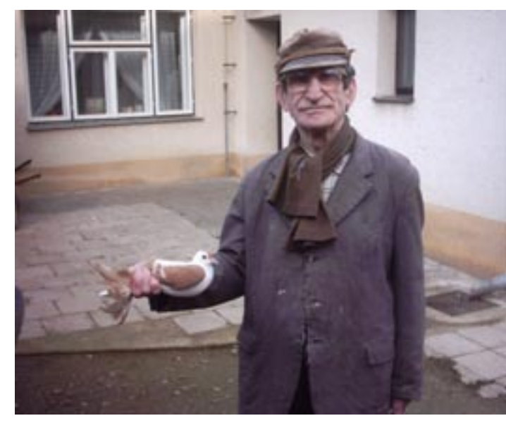
Czech Swallow Fancier.

United Swallow Club P.O. Box 152 Patagonia, AZ 85624