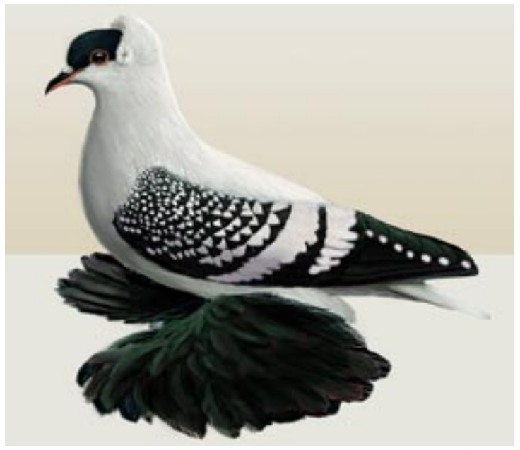
Black Spangled Fullhead Swallow Art By Gary Romig