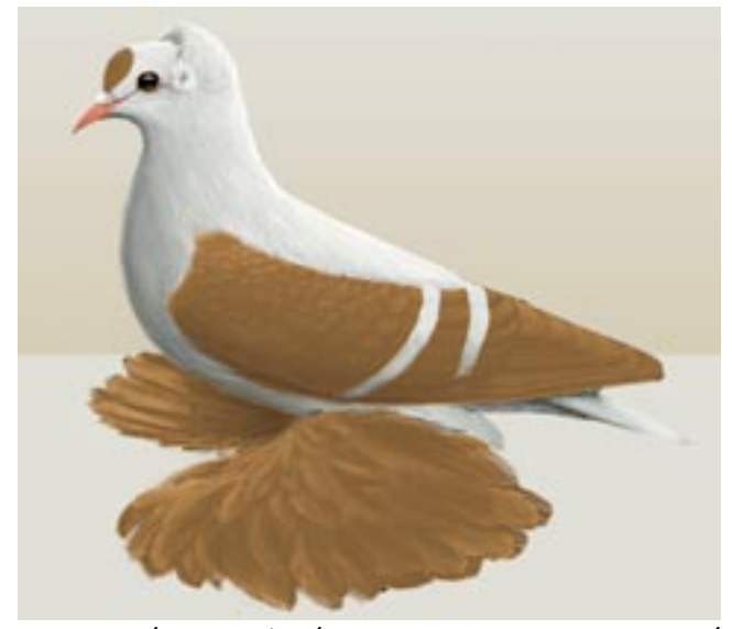
Yellow White Barred Fairy Swallow Art By Gary Romig